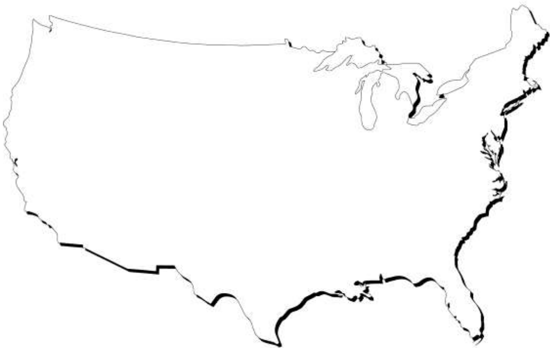
United States of America

This is a royalty free image that can be used for your personal, corporate or education projects. It can not be resold or freely distributed. If you need an editable PowerPoint or Adobe Illustrator version of this map please visit www.bdesign.com or www.mapsfordesign.com . This text can be cropped off.